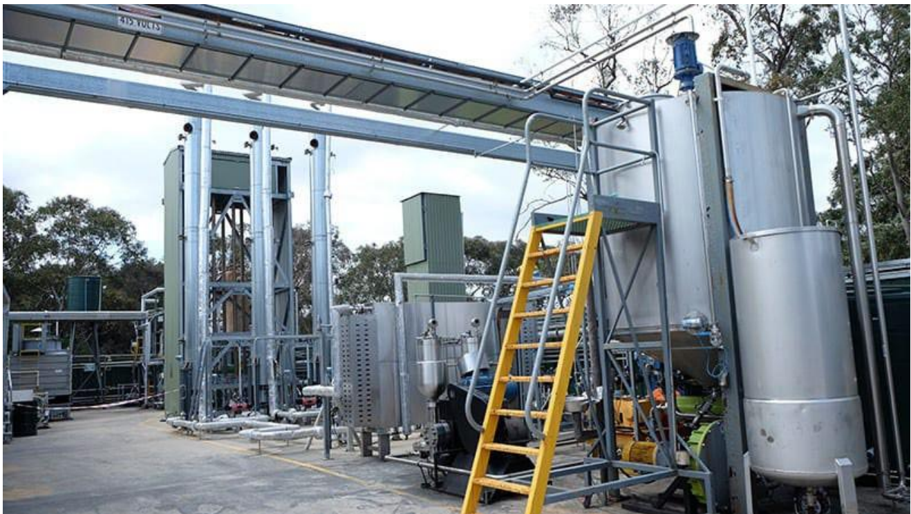
Figure 2 – CAT-HTR™ pilot plant for catalytic hydrothermal processing of waste plastic

In its 2020 assessment, Plastics Recycling and the Circular Economy: Catalytic and Compatibilization Solutions , TCGR highlighted a few emerging technologies for recycling various plastics but focused the report on very early-stage technologies. In this 2022 report, TCGR will focus on technologies for chemical recycling of polyolefins that are closer to commercial stage to examine both their technical and commercial potential. There are several paths being taken towards chemical recycling. The most advanced technology today is based on gasification or pyrolysis of plastic waste, and there are a number of projects underway, including those sponsored by SABIC, BASF, Clariant and their respective partners. Catalytic based technologies include catalytic hydrothermal processing (Figure 2), developed by Licella and licensed to Mura Technology. Mura Technology has announced partnerships with Dow Chemical, Mitsubishi Chemicals, and KBR to commercialize the technology.