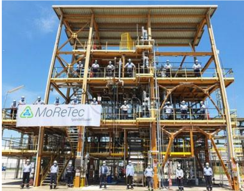
Figure 3 – MoReTec pilot plant for catalytic cracking of plastics

solvents to dissolve polymers so that additives and other contaminants can be removed before precipitating near-virgin polymer.